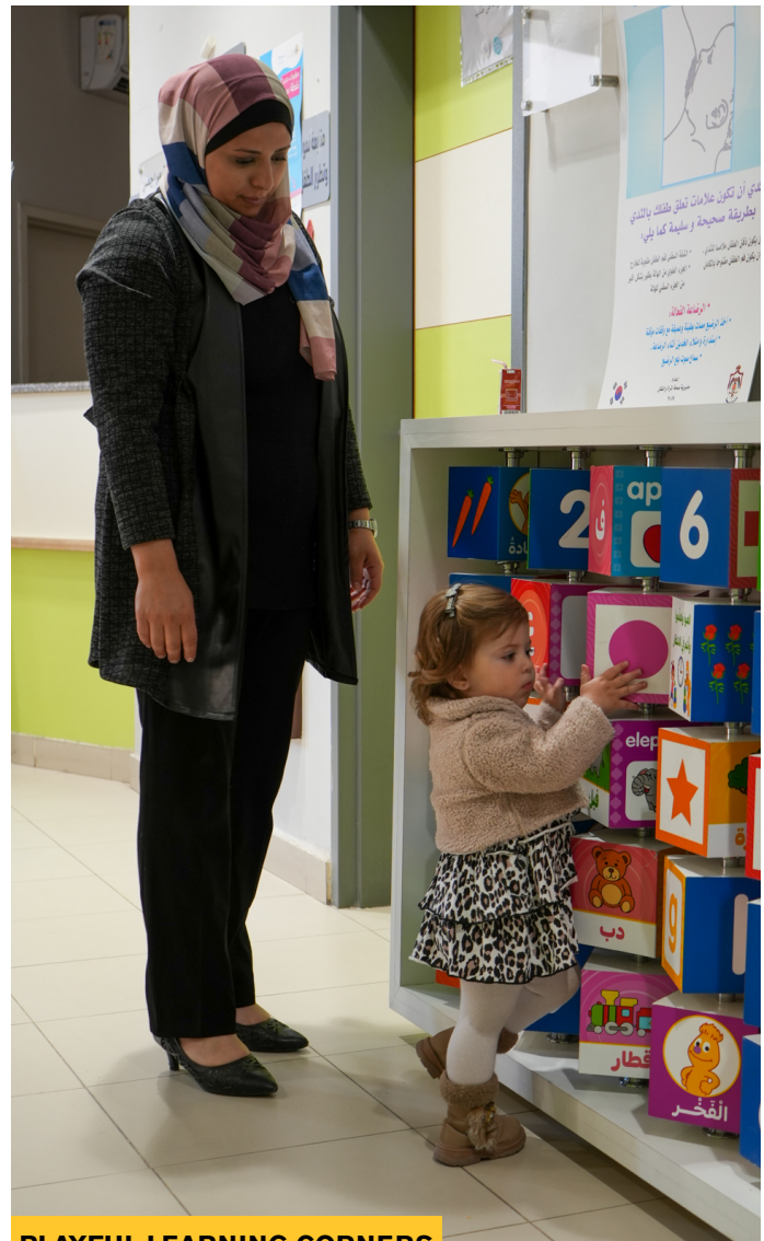
PLAYFUL LEARNING CORNERS

"Playful learning corners" (see image) were also installed in 100 clinic waiting rooms for children to engage with while waiting for appointments, reinforcing the importance of play in a child's development. To further support caregivers after the appointments, the IRC and MoH piloted an automated messaging service via WhatsApp in 10 primary healthcare centers. The program allows caregivers to receive additional activities and tips tailored to children's age groups directly to their phones on demand.