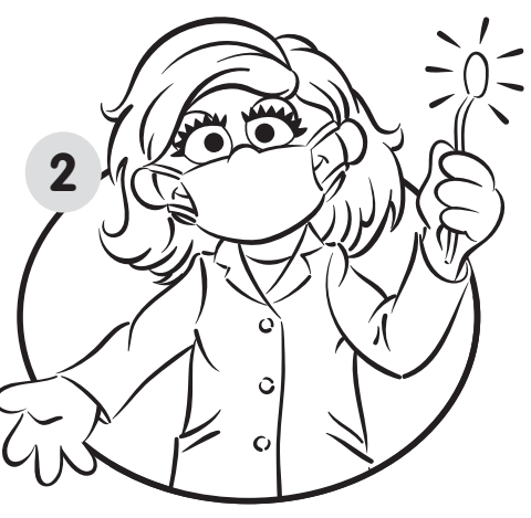
The dental hygienist put on a mask and some gloves. Now she's ready to count your teeth. Open wide! She'll use a light and this cute, little mirror to look inside your mouth. Then she'll touch every tooth.