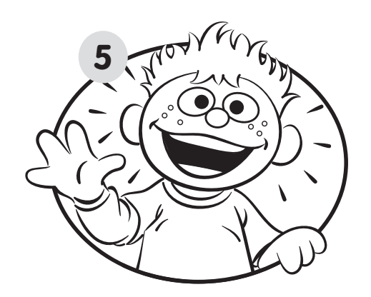
The dentist says your teeth look healthy! <u>Smile</u> and show off your clean teeth. Now let's <u>skip</u> home. Thanks for pretending with me!