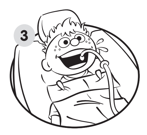
Cleaning time. The dental hygienist has neat tools to clean your mouth. Can you feel the curved straw resting in your mouth? It helps get the water out. It goes gulp, gulp, gulp.