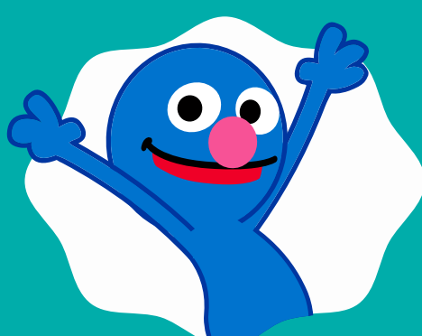
Stretch your body