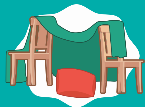
Build a blanket fort