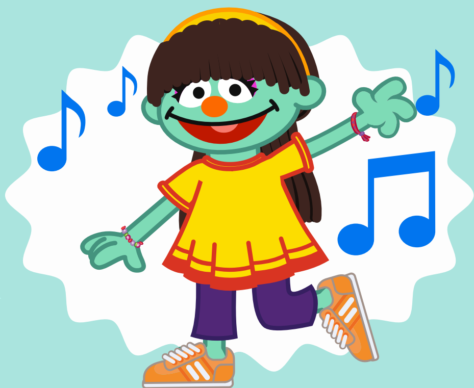
Raya likes to dance