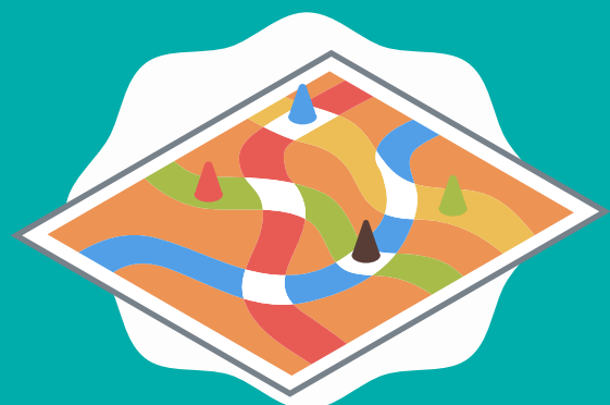
Play board games