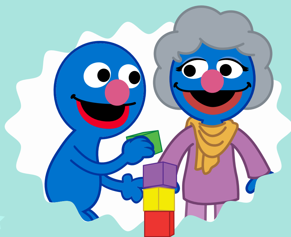
Grover likes to play blocks with his grandmother