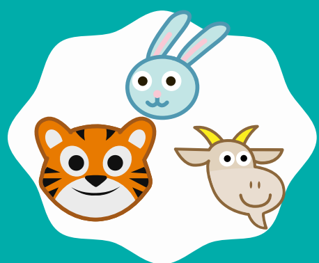
Pretend to be animals