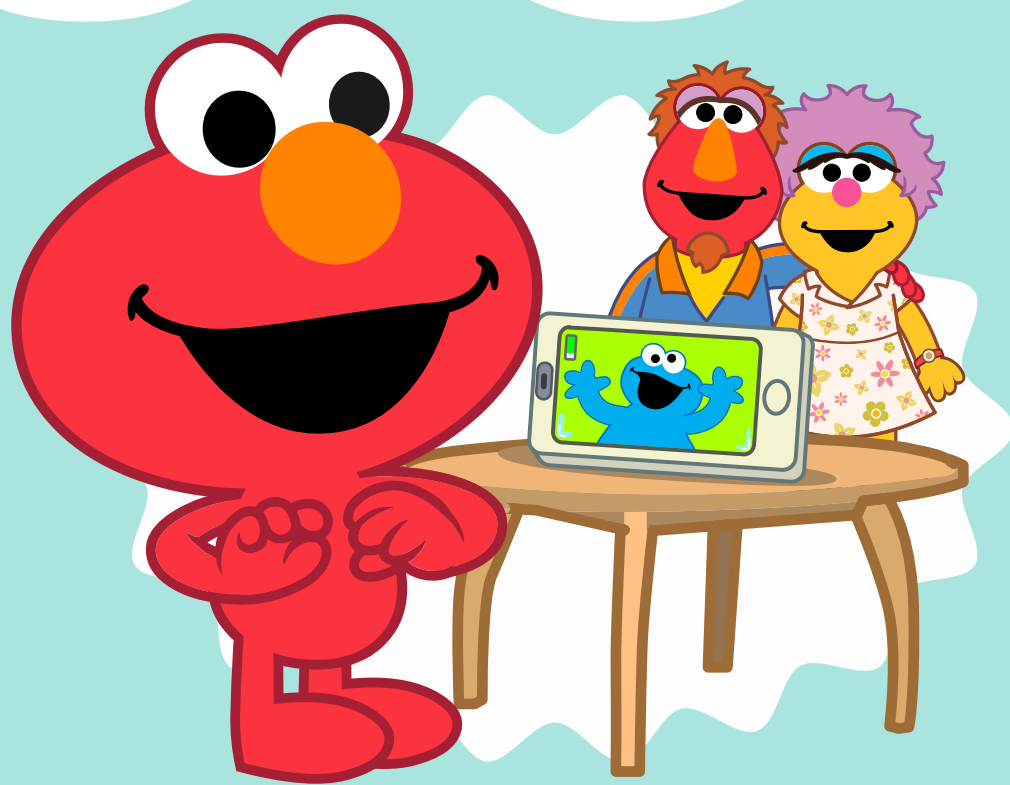
Elmo likes to talk to his friends on the phone

Doing things we enjoy helps us take care of ourselves and manage big feelings. See what your friends Elmo, Abby, Raya and Grover at Sesame Street like to do!