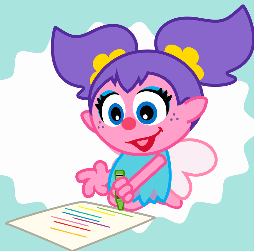
Abby likes to draw and color