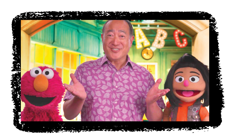
You can also sing and dance along to this special video, "People in Your Neighborhood"

Oh, who are the friends in your neighborhood? In your neighborhood? In your neighborhood? Say, who are the friends in your neighborhood? The people that you see each day?